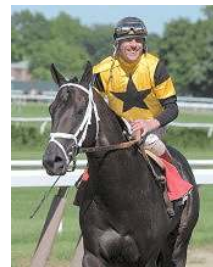
Seattle Fitz