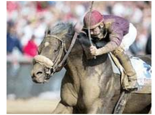
The Cliff's Edge