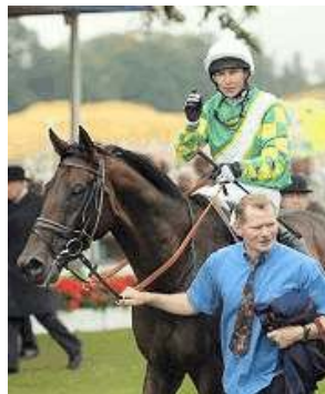
Rakti