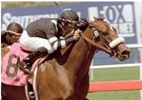
Adoration