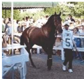
Rock Hard Ten