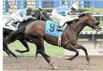
Olmodavor