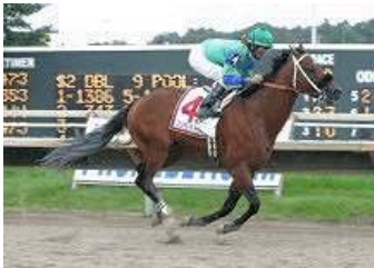
Love of Money