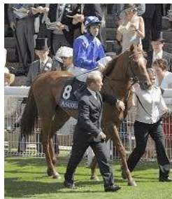
Haafhd Action Plus