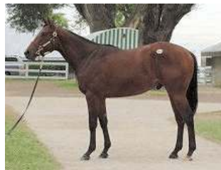
Hip 922