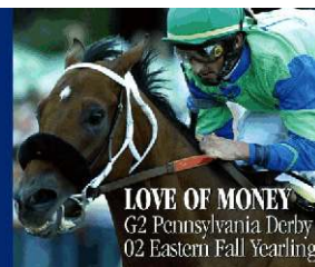
LOVE OF MONEY G2 Pennsylvania Derby 02 Eastern Fall Yearling

Since 1898 FASIG-TIPTON 410-392-5555 www.fasigtipton.com