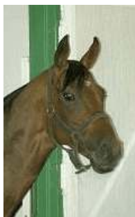
Epalo

Leading German sire Lando (Ger) (Acatenango {Ger}) will stand the 2005 breeding season at Haras d'Etreham after an agreement was reached between the French farm and Gestut Hoff Ittlingen, according to Racing Post . The 14-year-old stallion will stand for a fee of €7,500 next season. The bay, a Gestut Hoff Ittlingen homebred, stood at the German nursery for €9,000 this year. Twice Horse of the Year in Germany and winner of the G1 Japan Cup, Lando is enjoying a career year at stud in 2004. He is represented by three Group 1 winners in Epalo (Ger), Intendant (Ger) and Paolini (Ger).