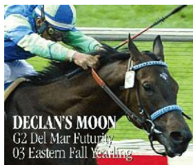
DECLAN'S MOON G2 Del Mar Futurity 03 Eastern Fall Yearling

Want to send a "Letter to the Editor" of the Thoroughbred Daily News ? Our address is 27 Monmouth St., Red Bank, NJ, 07701; or send a fax to: (732) 747-8955; or an e-mail to: mediavista@aol.com .