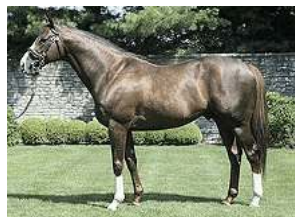
Giant's Causeway - sire of hip 693 www.coolmore.com

There were no seven-figure yearlings in the first section of Book 2, but the Keeneland September Yearling Sale continued to post impressive numbers Wednesday, with a pair of youngsters setting the standard of