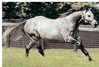
Monarchos - sire of hip 865