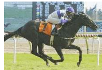
Fearless Flyer Woodbine photo