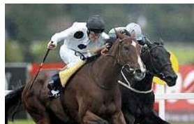
Soviet Song (black cap)

Soviet Song had outprinted Attraction to take the July 6 G1 Falmouth S. at Newmarket by 2 1/2 lengths, but it was much closer this time. Attraction set off in