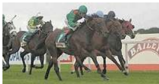
Azamour (green cap)

All the pre-race hype revolved around hot favorite Doyen (Ire) (Sadler's Wells), but he was off the radar as Azamour (Ire) (Night Shift) swooped from last to first to deny Norse Dancer (Ire) (Halling) in yesterday's G1 Irish Champion S. at Leopardstown. Settled in rear off the strong early fractions by Mick Kinane, the 8-1 chance quickened down the outside to collar Norse Dancer in the final strides. "He's a great horse," conditioner John Oxx said. "He's tough and genuine and showed a great turn of foot." Cont. p2