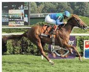
Spotlight at Saratoga

European expatriate Spotlight will try to make it three straight in this Grade I affair, but she'll have to face several tough runners from across the sea. The chestnut, who defeated Oaks heroine Oujia Board (GB) at two, won over a soft Belmont course in her U.S. bow July 23 and streaked to victory in the GII Lake Placid H. Aug. 23 at Saratoga, with Mambo Slew the runner-up in the latter. "She's a great filly, a tiny little filly, but very tough,"