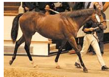
Necklace, selling for 600,000gns as a yearling