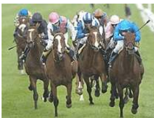
Rule of Law (far right)