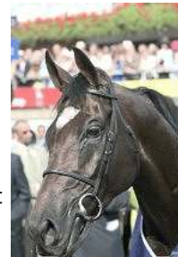
Doyen Action Plus

After his demolition job in the King George, Godolphin's Doyen (Ire) (Sadler's Wells) had jockey Frankie Dettori in raptures, and the colt could prove aptly named if he handles the small but stellar line-up in today's G1 Irish Champion S. at Leopardstown. Godolphin have won this with Swain (Ire), Daylami (Ire), Fantastic Light and Grandera (Ire) since 1998, and Doyen was heralded as equal to those past stars by Sheikh Mohammed after his facile three-length rout in the G1 King George VI & Queen Elizabeth Diamond S. at Ascot July 24, just three weeks after he had smashed that venue's 31-year-old track record in the G2 Hardwicke S. "He looks magnificent and has worked really well," Dettori said. "He gave me the feel of a champion...I feel he is better now than before the King George." Champion S. cont. p3