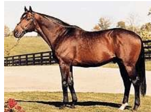
Deputy Minister www.windfields.com

Champion and leading sire Deputy Minister (Vice Regent--Mint Copy, by Bunty's Flight) died Friday at the