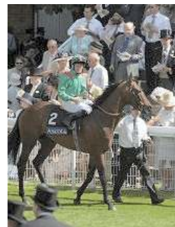
Azamour Action Plus

Sophomores have found their elders hard to handle in this contest, with Alamshar (Ire), Hawk Wing and Galileo (Ire) all failing to justify favoritism in the last three renewals. A pair of three-year-olds go after the top prize this year. Two-for-two at Leopardstown, Grey Swallow (Ire) (Daylami {Ire}) drops back from the 12 furlongs over which he lowered the colors of North Light (Ire) in the G1 Irish Derby at The Curragh June 27. In contrast, Azamour (Ire) (Night Shift) steps up from a mile, having won the G1 St James's Palace S. at Royal Ascot in his most recent appearance June 15. He previously had Grey Swallow behind him when third in the G1 2000 Guineas at Newmarket May 1 and second in the Irish equivalent at The Curragh May 22.