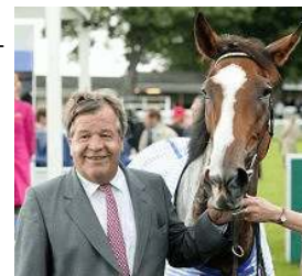
Quiff & Stoute Action Plus

Despite his major trophy haul over the years, Sir Michael Stoute's portfolio lacks the most historic prize of them all, but Quiff (GB) (Sadler's Wells) may be able to put that to rights in the G1 St Leger at Doncaster today. Connections welcomed yesterday's rain, as she coped so well with the deep ground when winning the G1 Yorkshire Oaks by 11 lengths Aug. 18. "She's a good-ground filly, but the rain will help," jockey Kieren Fallon said. "Although it's going to be tough against Rule of Law, I'm pretty confident now the rain has come." Fillies have a sound record in this Classic, with seven of the last 12 making the frame. But luminaries such as Diminundo, Hellenic (Ire) and Ramruma have failed to beat the colts, and it has been 12 years since User Friendly (GB) last won in 1992. Unlike those high-class fillies, Quiff arrives here fresh, having only her fourth start after her third in the G2 Ribblesdale S. at Royal Ascot June 17 and Yorkshire Oaks romp. St Leger cont. p4