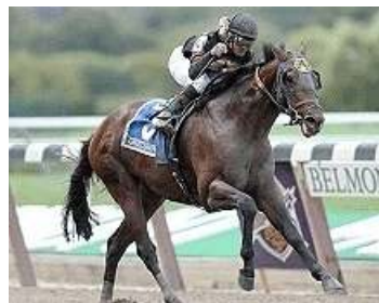
Ghostzapper

A Grade I-winning sprinter, Ghostzapper (Awesome Again) stretched out to two turns for the first time in his career for the Aug. 21 GIII Iselin Breeders' Cup H.