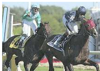
Powerscourt (#10)