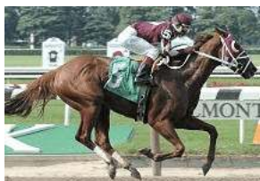
Magical Illusion