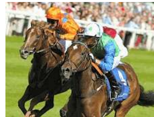
Playful Act