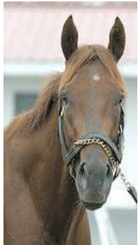
Smarty Jones