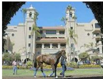
Roman Ruler at Del Mar

A field of seven juveniles will go postward in today's GII Del Mar Futurity, with a pair of unbeaten colts set to battle it out for supremacy of their division. Roman Ruler (Fusaichi Pegasus), the prohibitive 3-5 morning-line favorite, became an instant sensation with a dominating seven-length victory in the Aug. 15 GII Best Pal S. It was just the second career outing for the dark bay colt, who effortlessly won his debut by four lengths at Del Mar June 19, and came after a troubled trip in which he was forced to steady to avoid a fallen horse. Roman Ruler could