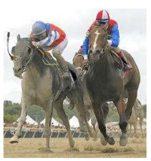
Reforest & Taittinger Rose Equi-Photo

Margins: DH, 2 1/4, 2. Odds: 1.70, 2.70, 11.40. Reforest was sidelined six months after breaking her