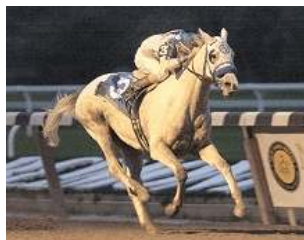
Gander in 2002