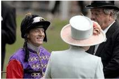
Kieren Fallon (left)