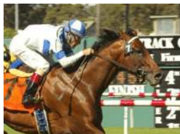
Candy Ride

Candy Ride (Arg) (Ride the Rails--Candy Girl {Arg}, by Candy Stripes), who set a track record when winning last year's GI Pacific Classic at Del Mar, has been retired and will stand the upcoming breeding season at