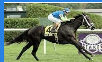
OCEAN DRIVE A Coglianese

She has now won or placed in 12 stakes for earnings of $691,986.