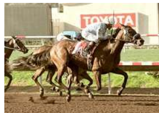
Sweet Catomine

Scan down the list of the broodmare sires responsible for Storm Cat's many graded winners and you will find that Pleasant Colony was by no means the only one that stood 16.2 hands or over. Among the others are Affirmed (16.2), Deputy Minister (16.2 1/2), Grey Dawn II (16.3), Saratoga Six (16.3), Lycius (16.2 1/2), Caro (16.3), Fappiano (16.3) and Graustark (16.3). There are also several others, such as Alydar, Hawaii and Private Account, who stood just under 16.2 hands. Cont. p4