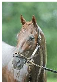
Lion Heart