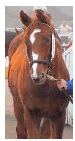
My Typhoon

Making her career debut in today's sixth race, a maiden going 1 1/16 miles on the turf, at the Spa is My Typhoon (Ire) (Giant's Causeway), who set a record for