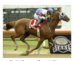
Gold Storm

Margins: 3/4, 5 1/4, 1. Odds: 9.00, 11.70, 0.60. Well-bred but inexpensively acquired at auction, Texas shipper Gold Storm upset the heavily favored