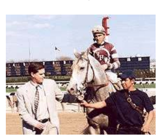
Tapit's Wood Memorial

Winchell Thoroughbred LLC's Tapit (Pulpit) breezed seven furlongs Friday afternoon in 1:27 at Delaware