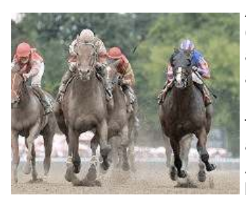
Bwana Charlie (2nd from left) defeats Pomeroy in Amsterdam

The 20th running of the GI King's Bishop S. at Saratoga this afternoon brings together some of the nation's top sophomore sprinters, including the top three finishers of the local prep, the GII Amsterdam S.