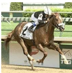
Sir Shackleton

pagne S. The diminutive bay was disappointing when running fifth in the Mar. 20 GII Lane's End S. and eighth in the May 1 GI Kentucky Derby, but he pulled it together in his latest appearance, sweeping past the valiant Smarty Jones to win the June 5 GI Belmont S. "He has lived up to our expectations," Zito said during the Travers draw at Saratoga yesterday. "He's a worthy horse. We call him 'Little Man' for obvious reasons, but he's got a big, big heart." Birdstone will be joined in the starting gate by The Cliff's Edge (Gulch), who bested fellow Travers hopeful Lion Heart (Tale of the Cat) in the GI Blue Grass S. in April, but had to settle for fifth on the first Saturday in May. Sidelined after the first leg of the Triple Crown with hoof problems, The Cliff's Edge returned to be second in the July 11 GII Dwyer S. and again when 4 1/2 lengths behind Travers morning-line chalk Purge (Pulpit) in the Aug. 8 GII Jim Dandy S. But the Zito horse to watch for might turn out to be Sir Shackleton (Miswaki). The chestnut colt, a winner of four of his seven starts, was freshened after finishing sixth in the May 15 GI Preakness. He might have been short of his best when third in the Dwyer, but he closed from just off the pace to take the Aug. 7 GIII West Virginia Derby by three lengths. "He's a dangerous horse," Zito warned. "He's doing everything right, like a good three-year-old would. He's getting good at the right time." Travers field, p2