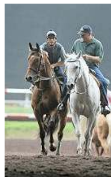
Perfect Drift

In his last two starts, Perfect Drift has faced Roses in May and come out on the losing end of the battle. The two first hooked up in the July 3 GIII Cornhusker Breeders' Cup H. at Prairie Meadows, with Perfect Drift sent off the 4-5 favorite, but it was Roses