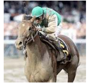
Afleet Alex