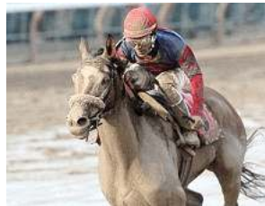
Society Selection