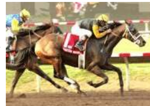
Choctaw Nation

Claimed for $40,000 from a maiden test at Santa Anita in February, Choctaw Nation quickly made his way up the ladder, following his debut score with a tally over starter allowance company in March, then taking back-to-back optional claimers. Freshened after a 3/4-length success at Hollywood May 28, he was a 6-1 chance while making his stakes debut in the San Diego, Choctaw Nation but put in his patented late run to take the photo from 3-5 Pleasantly Perfect, with During (Cherokee Run) another five lengths back in third. The four-year-old gelding stretches out to a mile and a quarter for the first time, but should handle the extra distance, as should Total Impact (Chi) (Stuka), who comes off a win in the July 10 GI Hollywood Gold Cup at the Classic route.