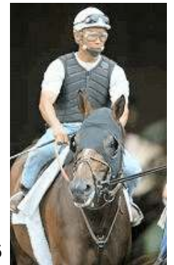
Pleasantly Perfect

Can Pleasantly Perfect (Pleasant Colony) rebound from a nose loss in the Aug. 1 Gil San Diego H.? Will Perfect Drift (Dynaformer) prevail? Can Choctaw Nation (Louis Quatorze) keep his perfect record intact? It remains to be seen who is the perfect fit for the 14th running of the 10-furlong GI Pacific Classic at Del Mar this afternoon. Eight runners at level weights of 124 pounds will gather where the surf meets the turf, and it is Pleasantly Perfect who has earned the role of 6-5 morning-line favorite. The six-year-old lost the bob to Choctaw Nation last time out, but he was making his first start since his dramatic victory in the Mar. 27 G1 Dubai World Cup and was giving his rival 10 pounds in the san Diego. He gets jockey Jerry Bailey in the irons for the first time today. Pacific Classic cont. p2