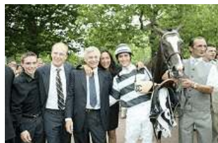
Whipper and co.

Whipper (Miesque's Son) had stamina to prove in the deep ground at Deauville, but the 5-1 chance quashed all doubts with a length defeat of Six Perfections (Fr) (Celtic Swing {GB}) in the G1 Prix du Haras de Fresnay-