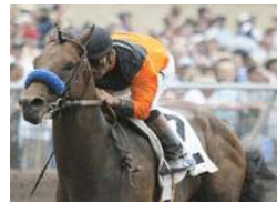
Roman Ruler

Roman Ruler (Fusaichi Pegasus), who dashed to an impressive four-length debut win at Hollywood June 19, made the jump to graded stakes company in smashing style with a dominant seven-length triumph in yesterday's GII Best Pal S. at Del Mar. After his maiden win at Hollywood, the Bob Baffert trainee was sidelined by an abscess, but showed he was ready for a return to the races with a bullet five-furlong drill in :57 4/5 at Del Mar Aug. 9. Sent off the 1-2 favorite yesterday, Roman Ruler was out of contention early after a tardy beginning. Forced to steady when longshot Wetherly (Expelled) broke down midway on the turn, Roman Ruler inhaled the leaders in upper stretch and pulled away effortlessly. "My horse was just terrific," said winning rider Corey Nakatani. "Bob [Baffert] and I spoke about him before the race and we said we were going to get him some education today. I was just going to sit on him and get him to relax. We weren't so concerned about winning. But he was so much the best that he just went ahead and won real easy anyway." Wetherly suffered a fractured left foreleg and had to be euthanized.