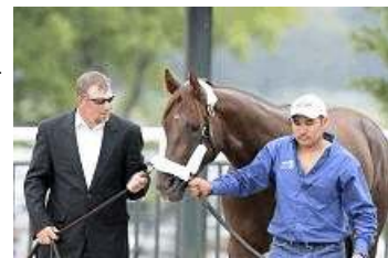
Smarty Jones

FAREWELL PARTY FOR SMARTY JONES Smarty Jones (Elusive Quality) was vanned to Three Chimneys Farm in Midway, Kentucky, yesterday evening, but first he had to say goodbye to his many fans at Philadelphia Park. Some 10,000 Smarty Jones fans turned out on a gloomy afternoon at Philadelphia Park to catch a final glimpse of the Kentucky Derby and Preakness winner. It was announced Aug. 2 that Smarty Jones, suffering from bone bruising, would not race again. Though