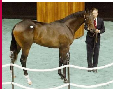
Saratoga Yearling Sale Topper GIANT'S CAUSEWAY Colt $1,850,000