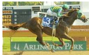
Alumni Hall