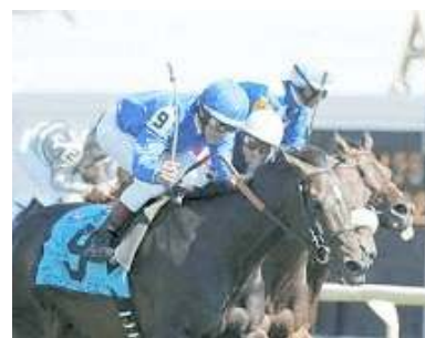
Winner GI Beverly D Stakes CRIMSON PALACE Sold to Godolphin