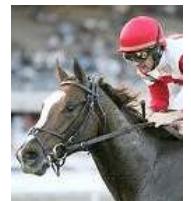
Kitten's Joy

Kitten's Joy (El Prado {Ire}) took on an international cast in the GI Secretariat S. at Arlington yesterday and ran his turf record to seven-for-eight. The chestnut colt, sent off the 9-10 favorite, settled in sixth early, but showed impressive acceleration in the stretch to win by a widening 3 1/4 lengths. Secretariat S. cont. p3