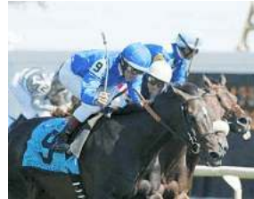
Crimson Palace