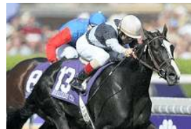
Six Perfections