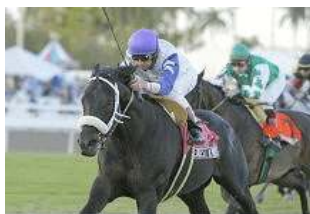
Request for Parole