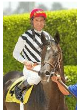
Greek Sun