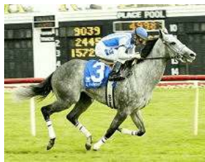
Bedanken

LADIES LEAD THE WAY The first of three Grade I events on Arlington's card Saturday is the $750,000 GI Beverly D. S., which has drawn an international field of 11. But though distaffers are shipping in from New York, California and Europe, the horse to beat just might be the remarkably consistent Bedanken (Geri), who has spent the summer at Arlington Park. The Pin Oak