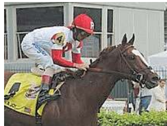
Kitten's Joy

The depth of the three-year-old turf division is substantial, since the absence of graded stakes winners Artie Schiller, Icy Atlantic, Prince Arch and Timo hasn't really diminished the quality of colts assembled for the Secretariat. Kitten's Joy has lost just once in seven turf