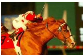
Sweet Return

A wide-open field of 13, which includes plenty of European imports, will be in the starting gate for today's GI Arlington Million. Represented by Sweet Return (GB)