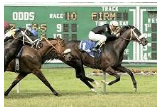
Balto Star

Confirmed front-runner Balto Star has won two of his three starts over this course, but faltered after cutting out the fractions in this event last year and finished last.