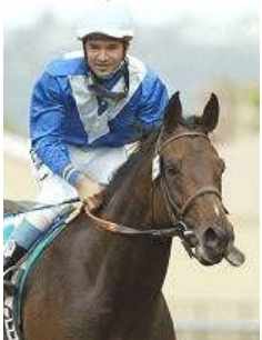
Musical Chimes

but a Kentucky-bred who first made her name as a Classic winner in France. After enduring troubled trips in her first four U.S. starts, the four-year-old was a confident winner of the GI John C. Mabee H. at Del Mar July 24 and should be flying late here. Joining her on the flight from California were Noches de Rosa (Chi)