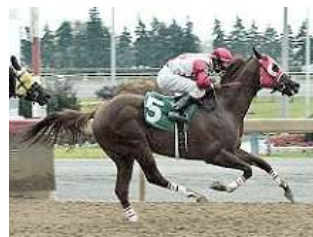
Wake at Noon

Wake at Noon (Cure the Blues), who was named the champion sprinter, champion older horse and Horse of the Year in Canada in 2002, has returned to training at Woodbine, the Daily Racing Form reports. The seven-year-old retired in January with 19 wins from his 47