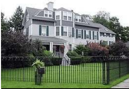
$1,650,000 Masterpiece Saratoga Springs, NY

This contest has been won by five subsequent Group 1 winners since 1991, including Classic heroes Rodrigo de Triano, Lammtarra and Haafhd (GB). Brecon Beacon surrendered his unbeaten record to the potentially top-class Whazzat (GB) when second in the Listed Chesham S. at Royal Ascot June 19, but regained the winning thread at the expense of subsequent Listed scorer Perfectperformance in a conditions event at Newmarket last time July 30. He has a penalty to defy against Wilko , who finished third in the G3 Superlative S. at Newmarket July 8. Wilko followed a second to Shamardal in the G2 Vintage S. at Goodwood July 28 with a confidence-boosting success in a Yarmouth conditions event last time Aug. 4.