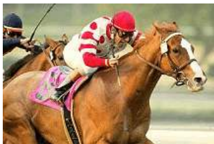
Sweet Return

The starting gate will be near capacity for the 22nd running of the GI Arlington Million. The names of 13 horses were tossed into the hat for the 10-furlong event yesterday, with Sweet Return (GB) (Elmaamul) earning the role of 7-2 morning-line chalk. The winner of the GI Hollywood Derby at three and the GI Frank E. Kilroe Mile H. and GI San Marcos S. this year at four, he comes off a third-place finish in the July 25 GI Eddie