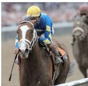
Purge