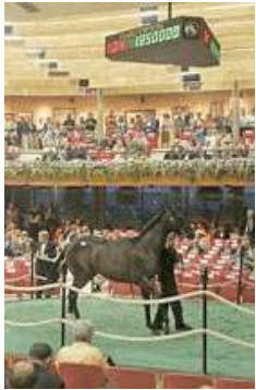
Hip 84