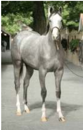
Hip 46--Unbridled's Song filly