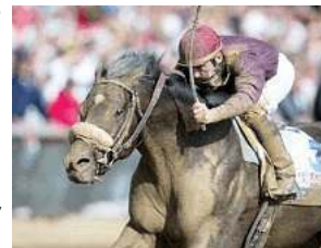
The Cliff's Edge