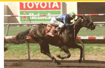
Union Train

Broke his maiden by 6 lengths at Del Mar Thursday!