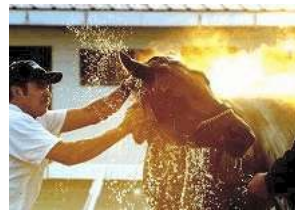
Smarty Jones

Philadelphia Park will host a farewell party Saturday, Aug. 14 for Kentucky Derby and Preakness hero