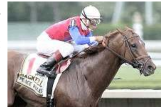
Peace Rules

Roses in May (Devil His Due) first drew attention with a 10 1/2-length score in a Saratoga allowance race last August. The four-year-old returns to the scene of that triumph for today's GI Whitney H. A lackluster sixth in the GII Jerome H. at Belmont Park in September, the dark bay colt returned to post a front-running 12-length victory in a Keeneland allowance Apr. 17. He made it two in a row with a wire-to-wire score at Churchill Downs May 21 and was again in front every step in the July 3 GIII Cornhusker Breeders' Cup H. at Prairie Meadows. The colt will have company on the front end from favorites Peace Rules and Seattle Fitz (Arg)