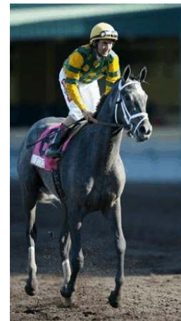
Smok'n Frolic