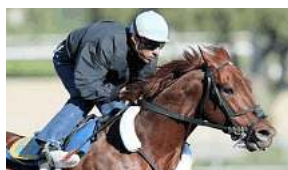
Lion Heart