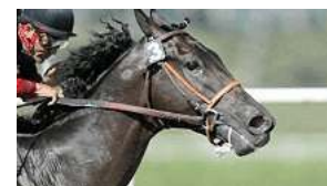
Rock Hard Ten