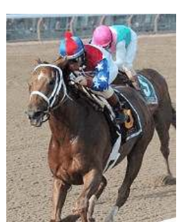
Azeri Draws Away