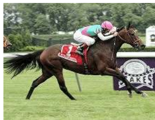
Intercontinental