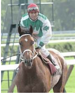
Afleet Alex

Afleet Alex (Northern Afleet) proved the demolition of Delaware Park foes in his first two career outings was no fluke with a resounding 5 1/4-length stakes-record setting win in yesterday's GII Sanford S. at Saratoga. The bay colt, sent off the slight 3-1 favorite, was allowed to rate off fractions of :22.29, :45.58, and :57.26, but stormed into contention with a five-wide move into the lane. He inhaled the leaders and drew clear with ease, stopping the timer in 1:09.32. Afleet Alex came into his stakes debut off a pair of dominating wins at Delaware Park, first taking his debut by 11 1/4 lengths June 26 and then adding a 12-length allowance tally July 12, covering both 5 1/2-furlong contests in 1:03 4/5. Cont. p. 2