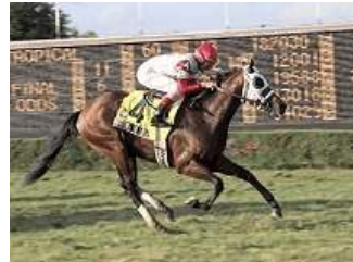
Nothing to Lose