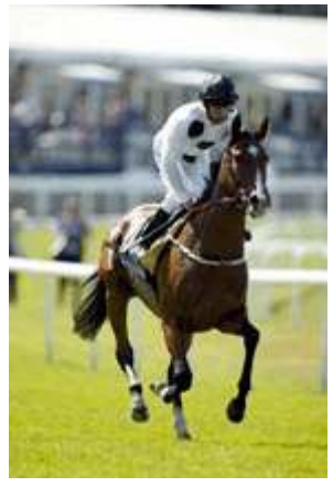
Soviet Song winning the Coronation S.

There is always a populist feel to any victory of the Elite Racing Club's Soviet Song (Ire) (Marju {Ire}), but