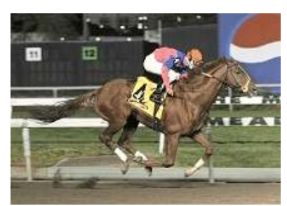
Bowman's Band winning the GII Meadowlands BC Cup

STATION Graded stakes winner Bowman's Band (Dixieland Band--Hometown Queen, by Pleasant Colony) will