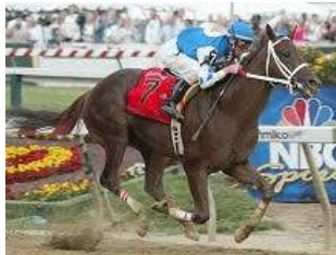
Smarty Jones