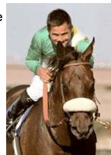
Sarafan