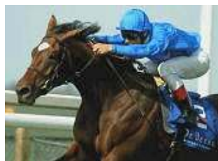
Doyen

He does the bare minimum in the mornings, but Doyen (Ire) (Sadler's Wells) showed how much he can bring to the table by beating the U.S. raider Hard Buck