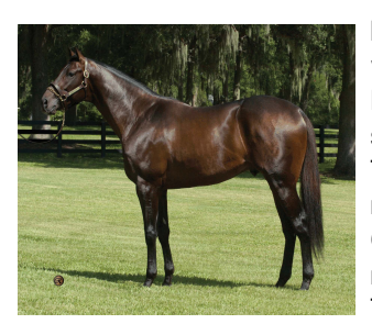
Spanish Steps

Unbridled's Song's Full Bro To Stand in Florida: Unraced Spanish Steps (Unbridled--Trolley Song, by