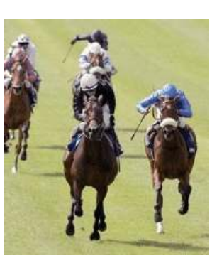
Ouija Board sweeps past Punctilious

Lord Derby's Ouija Board (GB) (Cape Cross {Ire}) swooped by Godolphin's Punctilious (GB) (Danehill) and