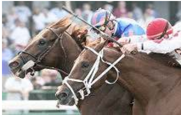
Lion Heart (outside)

Lion Heart (Tale of the Cat) was sent off at 1-5 to get back on track in yesterday's GIII Long Branch Breeders' Cup S. at Monmouth, but he had to dig in deep to deny local upstart My Snookie's Boy (Crafty Friend) to earn his first victory of 2004.