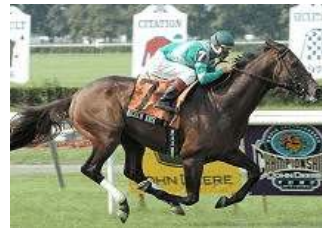
Kicken Kris

A Grade I winner in 2003, Kicken Kris (Kris S.) had disappointed in his last two starts, but came rolling in