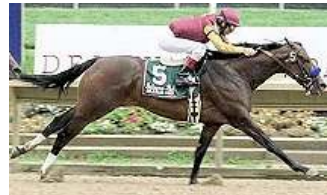
Yearly Report

At 2-5, Yearly Report (General Meeting) seemed like a mortal lock in the GII Delaware Oaks, but she had to fight off a persistent Ender's Sister (A.P. Indy) to take the $500,900 race. But it was easier than it looked, according to jockey Jerry Bailey.