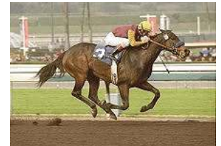
Yearly Report

Golden Eagle Farm's Yearly Report (General Meeting) has done little wrong in five career starts and will likely be the crowd's choice in today's GII Delaware Oaks. She began her career in impressive fashion notching a state-bred Hollywood maiden Nov. 29, then suffered her only defeat when second to Silent Sighs in Santa Anita's California Breeders' Champion S. Dec. 27. The Bob Baffert-trainee kicked off her three-year-old campaign on the right foot winning the GII Santa Ynez S. Jan. 19, then returned three months later to add the Melair S. versus fellow Cal-breds Apr. 24. Pegged as the 1-2 chalk to take the GII Black Eyed Susan S. last time, the bay filly didn't let her supporters down, winning by 1 1/2 lengths under Jerry Bailey. Ender's Sister (A.P. Indy) had a four-race winning streak snapped when second in the GIII La Troienne S. Apr. 29. She was last seen running third as the 4-5 chalk behind subsequent GI Mother Goose S. victress Stellar Jayne in Churchill's GIII Dogwood Breeders' Cup S. June 5. Former South Florida claimer Hopelessly Devoted (Storm Creek) has really sprung to life since shipping to the First State. After graduating versus $45,000 maiden claimers at Gulfstream, she notched a first-level allowance at Delaware May 4, then finished second in the Go For Wand S. May 29. Most recently a four-length winner of this track's Susan's Girl Breeders' Cup S., she will be tested for class today.