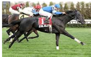
Better Talk Now

B.A. Way bids for his fourth straight victory and the fifth from his last six starts. The four-year-old started his streak with an allowance score at Churchill Downs in April, then shipped to Belmont and took a nine-furlong allowance May 15 and an optional claimer at the Bowling Green trip of 11 furlongs June 25. He makes his stakes debut. His older half-brother Better Talk Now ended 2003 with a win in the GII Knickerbocker H. at Aqueduct in November. The bay was off the board in his first two outings this term, but improved to