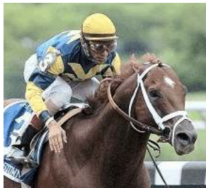
Speightstown