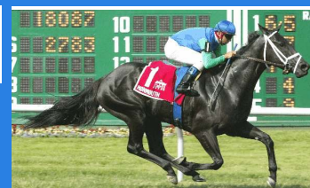
OCEAN DRIVE

She has finished on the board in 12 of 16 starts and has six stakes victories for earnings of $513,586.