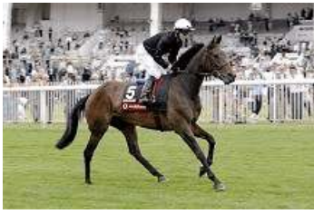
Ouija Board