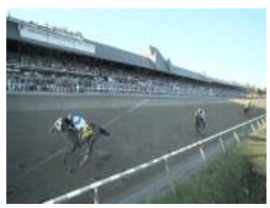
Ten Most Wanted winning the 2003 GI Travers S.