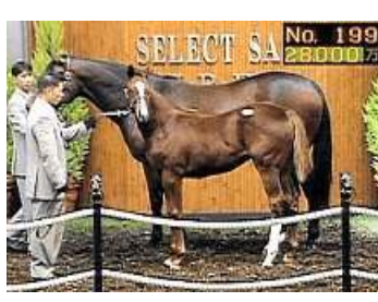
Hip 199 Gone West-Seattle Sunset colt a bid of ¥490,000,000.

Fusao Sekiguchi again brought sunshine into the hearts of those at Japan's Northern Farm when he offered ¥280,000,000 ($2,575,681) for Hip 199, a colt