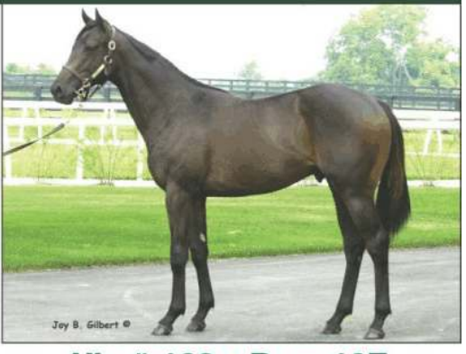
Hip # 160 • Barn 10E colt BRAHMS – Happy Gildmore, by Gilded Time