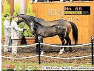
Air Groove & her record foal