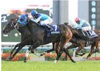
Admire Groove (# 7)

Air Groove (Jpn) (Tony Bin {Ire}) is back in the headlines. First, her four-year-old daughter Admire Groove (Jpn) (Sunday Silence) captured Sunday's G3-JRA Mermaid S., then her foal by Dance in the Dark (Jpn) set a world record when he topped Monday's opening session of the JRHA Select Sale at Northern Horse Park in Hokkaido. Consigned by Northern Farm, the bay colt