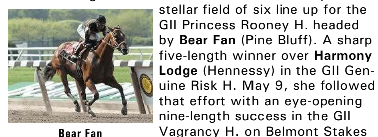
Bear Fan

Six stakes races totaling $1.75 million make for another exciting rendition of Calder's Summit of Speed. A