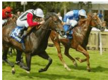
Frizzante (left)

Frizzante (GB) (Efisio {GB}) was sent off a generous 14-1 shot to beat the boys in yesterday's G1 July Cup at Newmarket, but her dramatic turn of acceleration was too much for them all as she swooped from the rear to best Ashdown Express (Ire) (Ashkalani {Ire}) by a neck. She seemed to have received one of the worst draws in 18, but jockey Johnny Murtagh played it cool early and she rewarded his confidence with a burst that took her past the 100-1 outsider in the final 50 yards. Having stamped herself as an