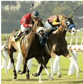
Lovely Rafaela and Western Hemisphere battle in the Honeymoon Benoit

hardly disgraced by her fourth-place effort. Jockey Yutaka Take, no stranger to U.S. racing, is in for the ride. Trainer Dermot Weld, who sent Dimitrova over from Europe to take last year's Oaks, is back with another talented shipper in the form of Misty Heights (GB) (Fasliyev). The bay was second to Alexander Goldrun (Ire) in the G3 Derrinstown Stud 1000 Guineas Trial May 9, but was just a midpack eighth in the G1 Irish 1000 Guineas two weeks later. A half sister to