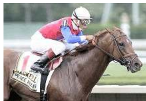
Peace Rules

Peace Rules will try to carry his speed 10 furlongs for the first time. The four-year-old has tried the distance