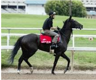
Dance in the Mood www.hollywoodpark.com

Fourteen three-year-old fillies, bred in six different countries, get together for this afternoon's third running of the American Oaks, which has already achieved Grade I status. Dance in the Mood (Jpn) (Sunday Silence), one of just two in the field to win at the top level, took her first four trips to the post, including the G1 Japanese 1000 Guineas in her penultimate start Apr. 11. The Shadai homebred failed to negotiate the 12-furlong distance of the May 23 G1 Japanese Oaks in her last appearance, but was