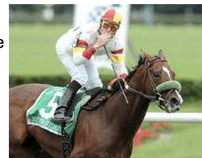
Meteor Storm