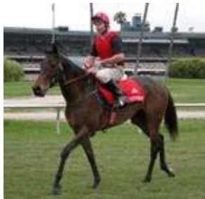
American Oaks contender Boulevardofdreams

Sagitta Ra (Run Softly) and Amorama (Fr) (Sri Pekan), third and fifth, respectively, in the June 5 GII Honey-moon Breeders' Cup H., gained a berth in Saturday's GI American Oaks at Hollywood Park following the defections of Miss Vegas, who will