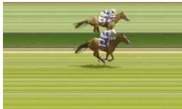
Divine Proportions

With only one previous start to her credit, Divine Proportions (Kingmambo) made up in talent what she lacked in experience when she cruised home an easy winner in Monday's G3 Prix du Bois at Chantilly. The filly looked to have a bright future ahead when recording a fluent debut score at Maisons-Laffitte May 26 and confirmed that impression with an eye-catching success against seasoned opponents here. Settled in third early by Christophe-Patrice Lemaire, she stalked the speed duel between Great Blood (Fr)