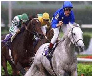
Daylami winning the GI Breeders' Cup Turf

I was interested to hear one of Grey Swallow's connections say that he was sure the colt would be suited by a mile and a half, because Daylami won over the distance and so did The Minstrel, the sire of Grey Swallow's dam. I am not sure I would have been quite so confident: Daylami--a classic winner over a mile--didn't score over that distance until he was five, and The Minstrel was somewhat unpredictable where stamina was concerned.