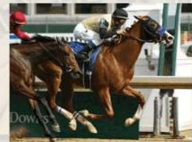
Taylor Made Fasig Tipton July Graduate FRIENDLY MICHELLE (G3), by Artax, shown winning the Grade 3 La Troienne S.