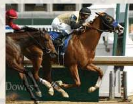
Taylor Made Fasig Tipton July Graduate FRIENDLY MICHELLE (G3), by Artax, shown winning the Grade 3 La Troienne S.

LOOK FOR THE FOLLOWING HIP#S AT OUR CONSIGNMENT THIS JULY.