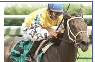
ANGEL TRUMPET wins at Churchill 6/24