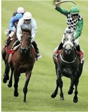
Grey Swallow (right) bests North Light

Grey Swallow (Ire) (Daylami {Ire}) finally delivered the Classic success his juvenile campaign promised, beating Epsom Derby winner North Light (Ire) (Danehill) by a half