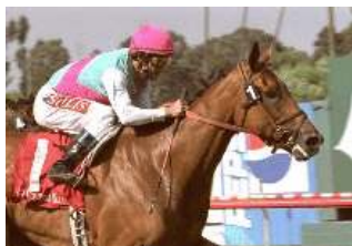
Light Jig

Light Jig placed in a pair of Listed events for trainer Pascal Bary in France last year, but failed to hit the board in three subsequent starts overseas. A winner for new trainer Bobby Frankel in her stateside debut in a