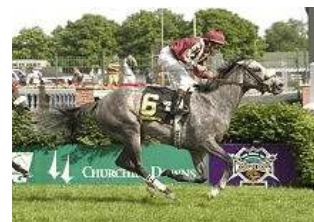
Four Footed Fotos

Winless in five starts after taking the Ontario Colleen S. at Woodbine last August, Shaconage was let go at 19-1 in the May 1 GIII Argent Mortgage Distaff Turf Mile S. at Churchill Downs, but finished full of run to catch a slumbering favorite Etoile Montante by a nose. The gray couldn't produce the same kick in her latest, however, and had to settle for fifth in the May 29 GIII Mint Julep H. A distant third choice to bounce back here, she settled in fifth as Sand Springs cut out the fractions, began closing ground as they came out of the turn, grabbed the lead late in the lane and drew clear. Click for the brisnet.com chart.