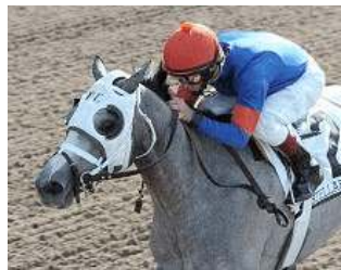
Stellar Jayne

Maybe her horoscope predicted it. Stellar Jayne (Wild Rush) was sent off the 29-1 outsider in the GI Mother Goose S., but shocked the crowd with a decisive 2 1/2-