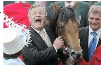
North Light & Sir Michael Stoute

Conditioner Sir Michael Stoute was responsible for two of the last eight Epsom heroes to follow up in this contest, but has endured a drought since Shahrastani took the spoils in 1986. After beating Rule of Law (Kingmambo) and Let The Lion Roar (GB) (Sadler's Wells) in the G2 Dante S. at York May 12, North Light led home those conquered foes at Epsom by 1 1/2 lengths and a head last time. His strong galloping style will be suited by the nature of this track and he sets the standard. Epsom's contours seemed to find out Rule of Law and Let the Lion Roar, who got behind on the downhill run before finishing fast and late. The former represents Godolphin, who took this in 1994 with Balanchine. He bids to emulate El Gran Senor, Law Society and St Jovite, who filled the runner-up spot at Epsom before going one better here. Jockey Frankie Dettori is hoping there are holes in the favorite. "North Light won on merit and is the best three-year-old 1 1/2-mile horse, but you can't be frightened of one horse," he said. "He could have an off day and we could come good." Irish Derby cont. p2