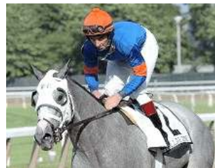
Stellar Jayne

Stellar Jayne (Wild Rush) won three of her five starts as a juvenile, capping her hattrick with a rallying score in the Nov. 1 Pocahontas S. at Churchill Downs. But