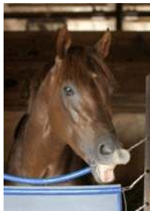
Smarty Jones