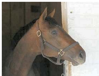
Ten Most Wanted

Grade I winner Ten Most Wanted (Deputy Commander), whose retirement was announced in May, could return to the races in 2005, according to Daily